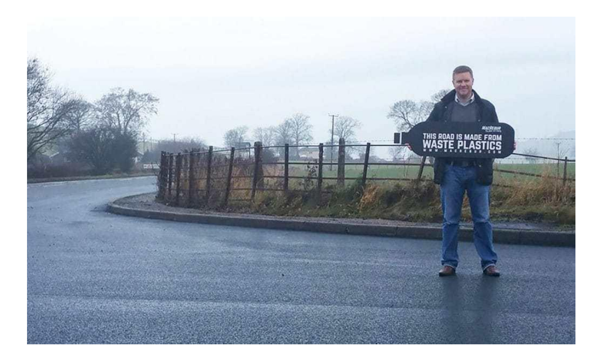
Figure 11: Macrebur is a company in UK constructs Plastic roads