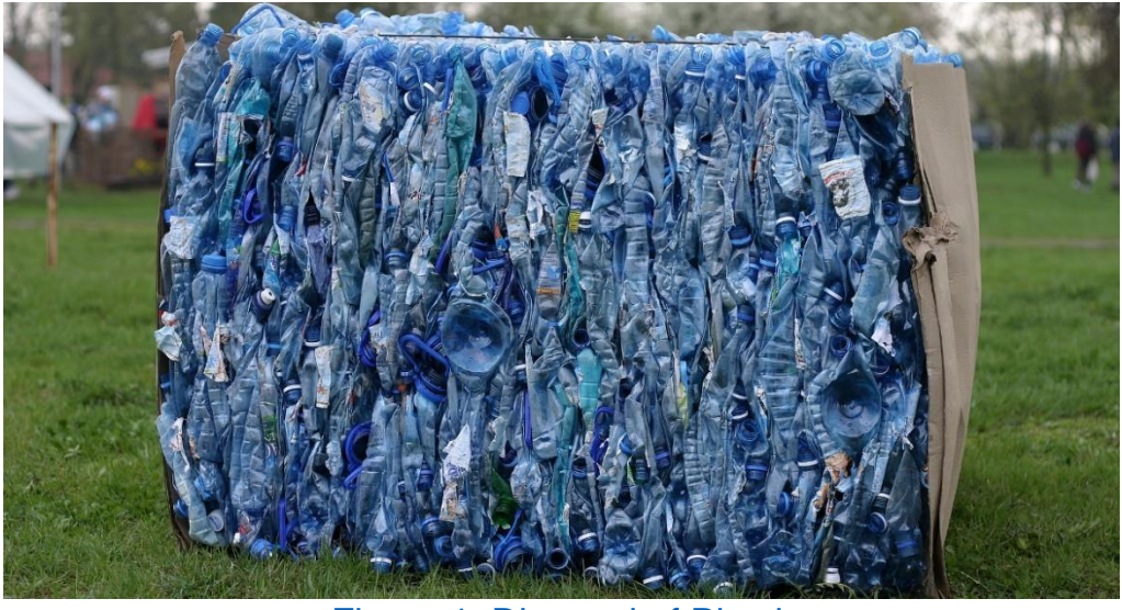
Figure 1: Disposal of Plastic

Plastics are the materials which consists of a variety range of synthetic or semi-synthetic organic compounds with a high molecular weight, it is a solid in its finished state or it can be shaped by its flow when it is manufactured or processed in to its finished state. The production rate of plastic is getting increased day by day in all parts of the world since past few decades. Due to the tremendous growth in population, consumerism, industrialization and technological development there has been a rapid increase in the rate of the production.