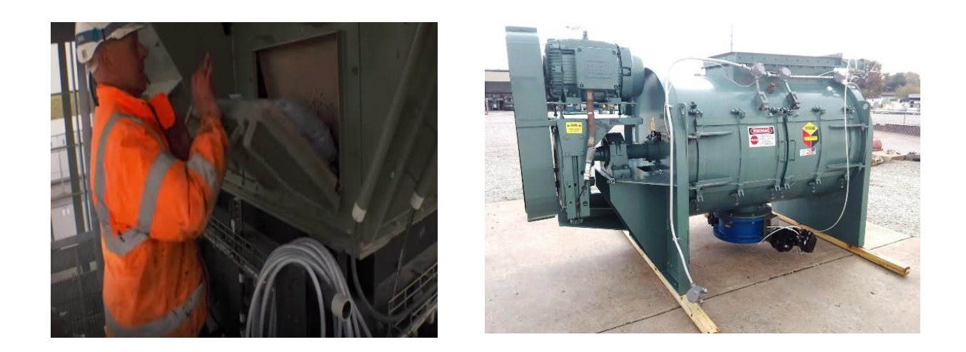
Figure 6: Transferring the Bitumen to mixing chamber

Step 4: At the mixing chamber, the shredded waste plastic should be added to the bitumen and it gets coated uniformly over the aggregate with in a time of 30 to 60 seconds by giving an oily look the aggregates.