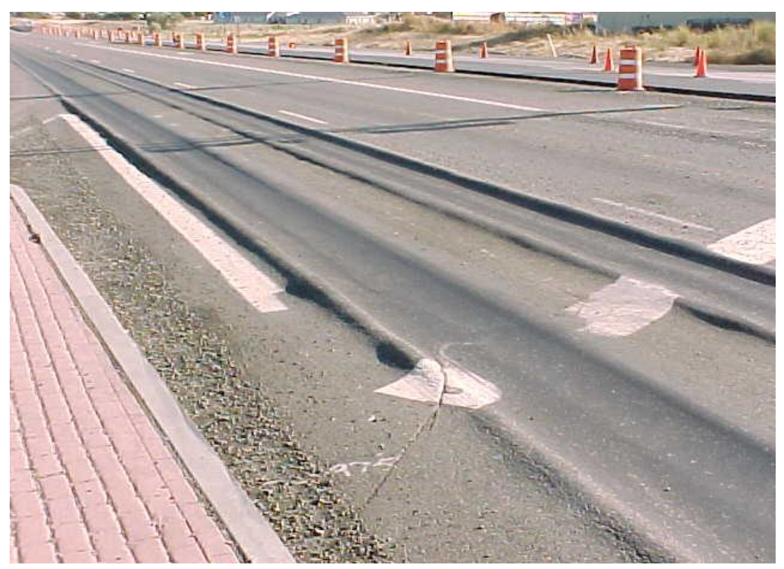
Figure 2: Rutting of Asphalt roads

2.1 Bitumen: It is a black brown viscous material which is composed of hydrocarbons which has high molecular weight, it is the residue leftover from natural or refinery process of petroleum and also having adhesive properties. It is a kind of strong cement which is readily adhesive with high water proof. The overall aim of this research report is to show the feasibility of modified bituminous mixtures by adding plastic waste as a partial replacement of bitumen in any asphalt mix so as to get rid of potholes on the roads. It is shown by Jafar, (2016) it is essential to choose the right bituminous mixture that would display clearly about the benefits of the modification. Bituminous mixture is divided in to two categories: a) Hot rolled asphalt and b) Bituminous Macadam.