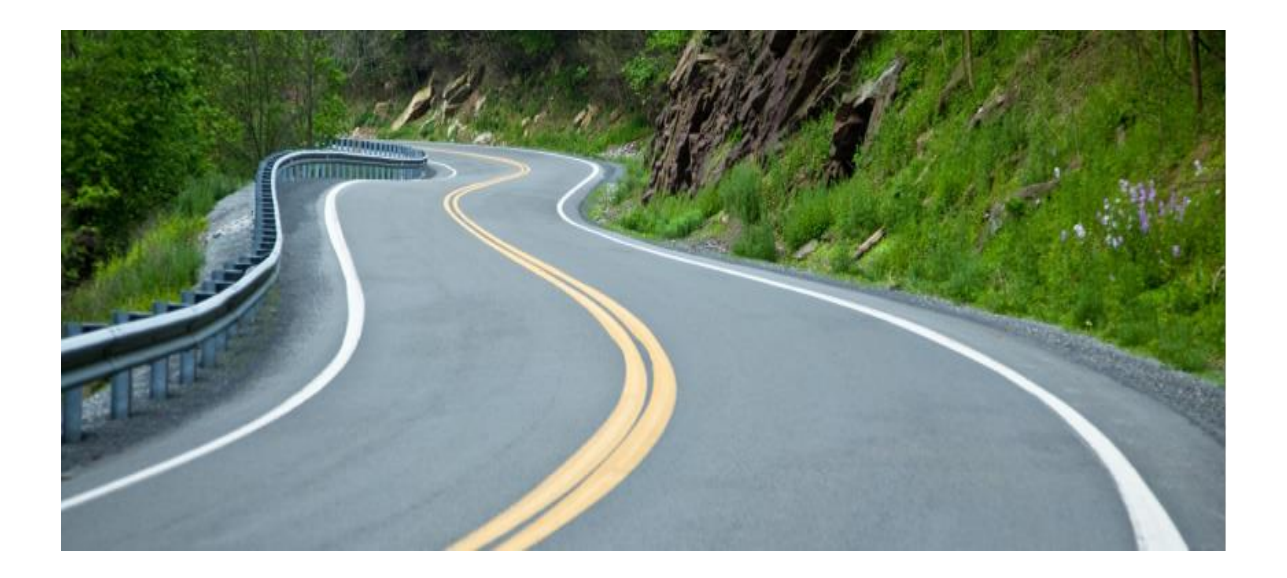
Figure 9: Some of the Texas Roads Made from Plastic

Figure 8: Flow chart of plastic coated bitumen mix from Mir, A. H. (2015)