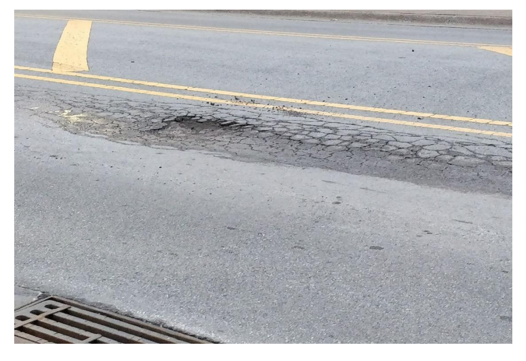
Figure 10: Potholes were formed in front of the ENGR Building, SIUC

Resistance towards water stagnation (i.e. No potholes are formed as shown in the Figure 10)