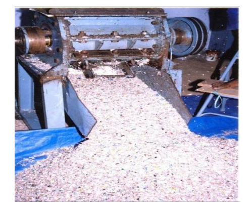
Figure 5: Plastic after passing through shredding machine

Step 2: The aggregate mix is to be heated up to a temperature of 165°C (as per the specification) and then it should be transferred to the mixing chamber. The amount of plastic to be added is around 8% of the bitumen.