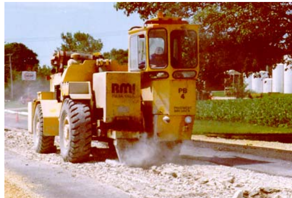
Figure 2: Resonant Frequency Breaker