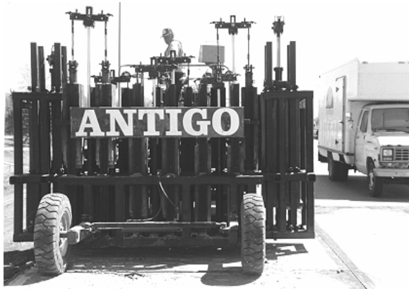
Figure 3: Multi-Head Breaker

A Z-Pattern Steel Grid Roller , with Z-shaped steel treads, follows the MHB to break flat and elongated particles into a more cubicle shape.