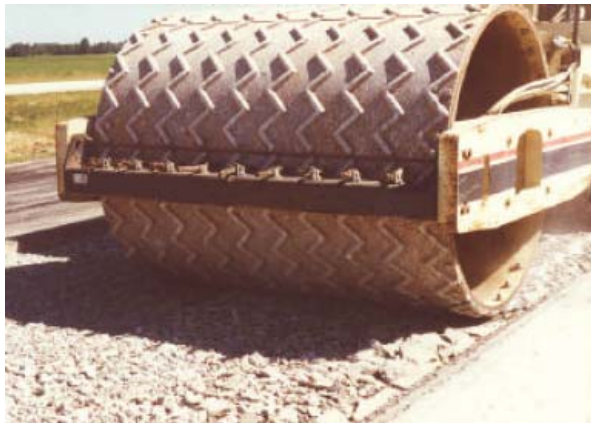
Figure 4: Z-Pattern Steel Grid Roller

A Z-Pattern Steel Grid Roller , with Z-shaped steel treads, follows the MHB to break flat and elongated particles into a more cubicle shape.