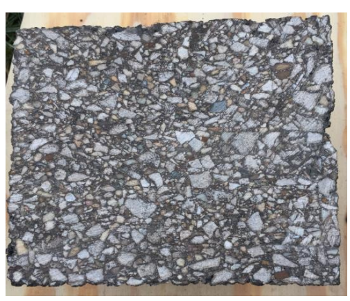
Figure 4: 9.5 NMAS Dense-Graded Mix Section.

Figures 3 and 4 reiterate what the mix gradations and power .45 chart present. When comparing the two mixes, the SMA has a coarser aggregate structure while the dense-graded mix has a more even distribution of aggregate sizes. For the SMA sample, force normal to the top of the cut section will be distributed primarily amongst the aggregate coarser than the PCS. This contrasts with the dense-graded section where force normal to the top of the cut will be distributed primarily amongst aggregate finer than the PCS.