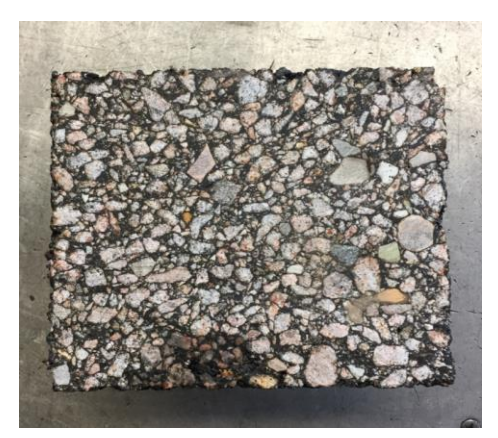
Figure 3: 9.5 NMAS SMA Section.

Figure 3 shows a compacted test sample of the SMA cut in half on the vertical plane. Figure 4 shows a compacted test sample of the dense-graded mix cut on the same plane.