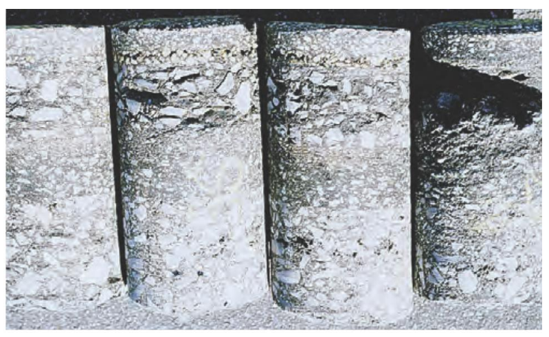
Figure 2: Asphalt Cores [5]