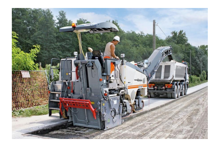
Figure 1: Milling Machine [1]

Asphalt milling is the process of removing old asphalt pavement on the road. To remove the asphalt safely from the road, engineers and construction managers use a machine called the asphalt milling machine, and it removes the bituminous material from the road and will leave the road in a rough but drivable condition. The first milling machines were made in the 1970s in Ohio, and they were called Galion, later to be just called a milling machine; a typical milling machine is shown in figure 1.