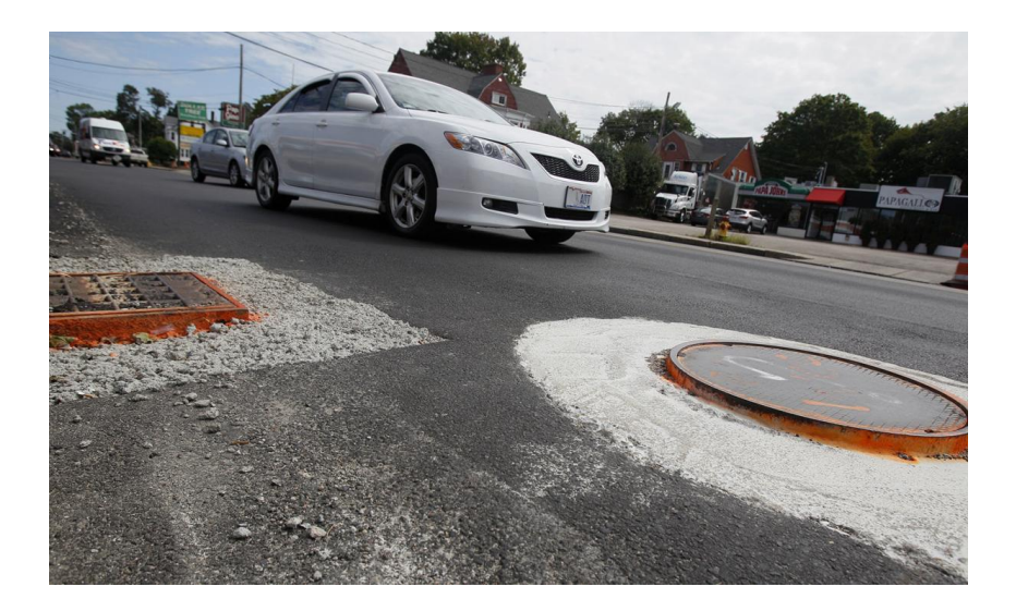
Figure 5: Asphalt Edge Milling

edge milling is done slowly around the structure and keeps damages to a minimum instead of wrecking the whole street [2].