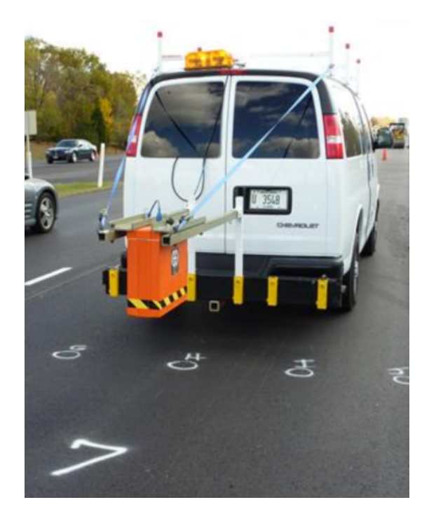
Figure 2: Typical GPR setup on a van

The work plan for this objective is to use the existing dataset of mix properties for one of the built lanes (lane II-(b)) and its corresponding static GPR scans for 8 different locations along the lane to estimate the specific gravity using ALL prediction model (Figure 2 below shows the usual GPR setup on a van). The results will be checked against lab-measured bulk specific gravities of extracted field cores at the same locations where the GPR static scans were taken, considering extracted cores' specific gravity values as ground truth values, those core data were also reported in the paper by Leng el. Al [5]. Simple statistical analysis will be performed at the end to judge on the accuracy of the ALL model compared to the previously tested models and the feasibility of using GPR for in-situ density estimation of asphalt pavements will be judged accordingly.