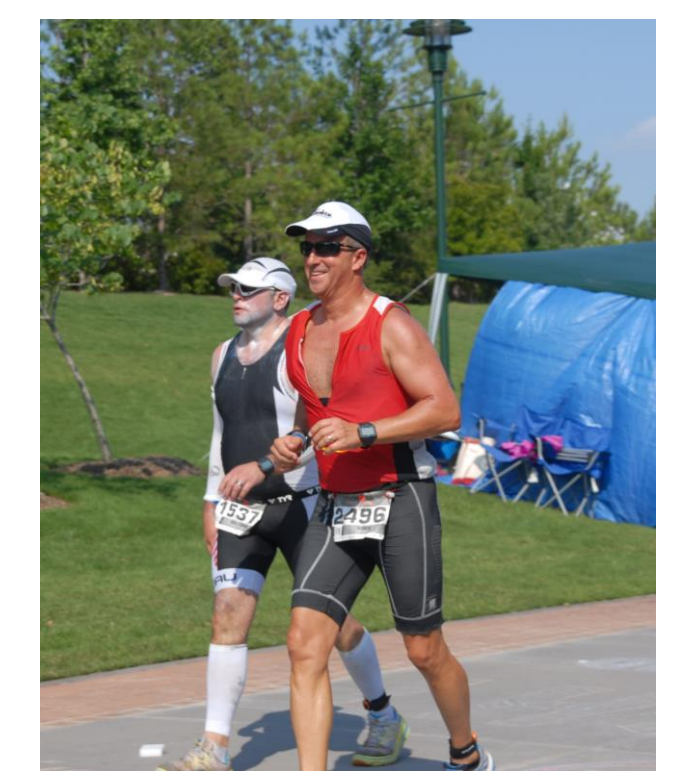
114.6 miles down. Only 26 more to go.